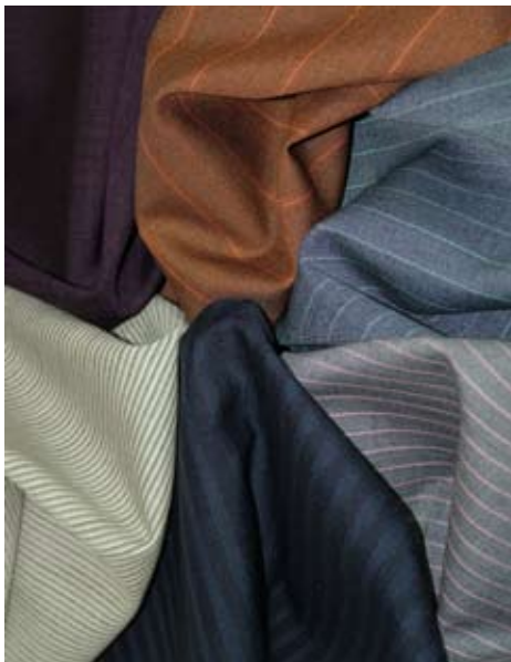
HS 119 ENGLISH MOHAIRS - 288000'S