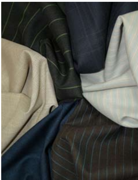
HS 129 SNOWY RIVER - 368000'S

Improved uniformity and consistency of each fibre length, plus the elimination of coarse fibres, result in a softer, kinder fabric. Clear, icy streams and undulating flower filled meadows create cleaner habitats resulting in whiter, cleaner fleeces which allow a more efficient dye uptake. The result; a fabric with superior colour levelness and light refraction. Uniform fibres offer increased comfort, appearance and performance resulting in improved garment shape retention and durability.